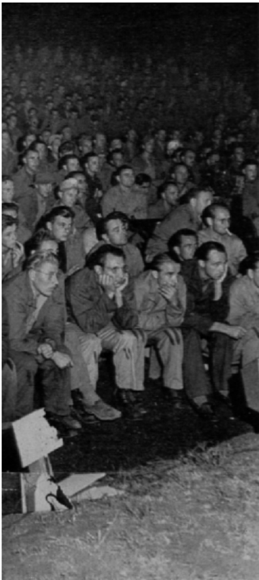
German subtitles. Favorites are Disney cartoons. They dislike war pictures. In PW-built theater men produce their own plays, make costumes of gunny sacks and odds and ends.