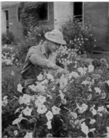
Prisoners raise flowers, keep grounds in order. Some made swastikas of pebbles for decoration. When officials objected they replaced them with question marks, which were allowed.