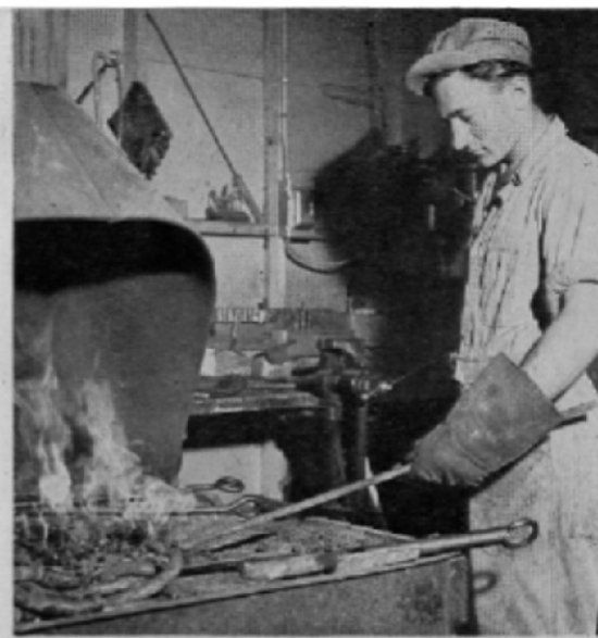
In blacksmith shop PWs weld and sharpen tools for camp machinery. Majority were farmers or laborers in Germany and used to hard work. A few were students and merchants.