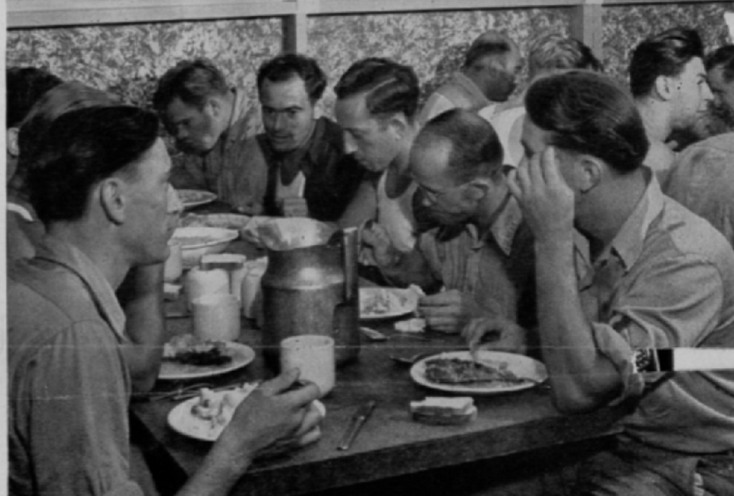
Mess is ample. In accordance with rules of Geneva Convention prisoners get U. S. Army rations. It is undoubtedly best food they have ever had. When prisoners first arrived they